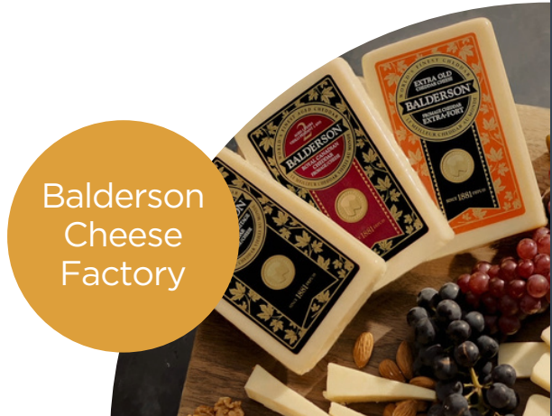
Balderson Cheese Factory

After a hot breakfast (included), we will pack up and depart the hotel and drive to Campbellford where we will visit Westben Farm and enjoy a private recital with Brian Finley and Donna Bennett and a lunch (included) on the farm. After lunch we will depart for home with our hearts full of wonderful sights and amazing stories of how God is having an impact around our province.