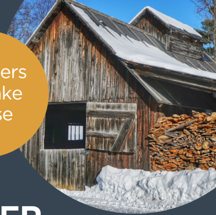
Wheelers Pancake House