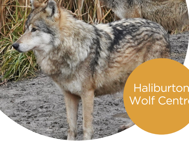
Haliburton Wolf Centre